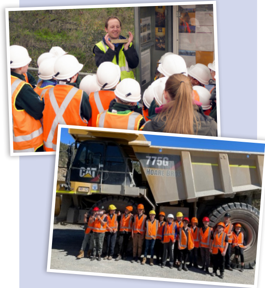
Above: School mine site tours in 2022.

Images below courtesy of Agnico Eagle (Fosterville gold mine)